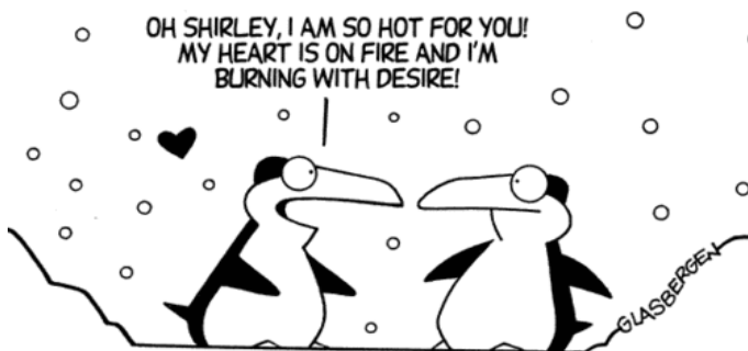
The Real Reason The Ice Caps Are Melting.

© 2000 Randy Glasbergen. www.glasbergen.com